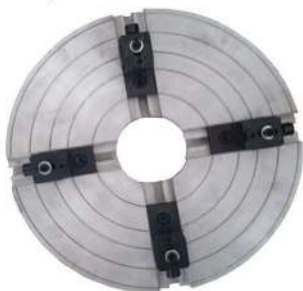
Stub end device for short flange.